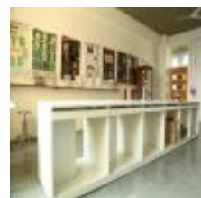
BIOLOGY LAB PHOTO