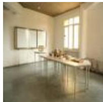
PHYSICS LAB PHOTO