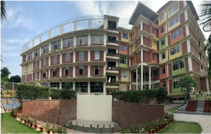
SCHOOL BUILDING PLAY GROUND