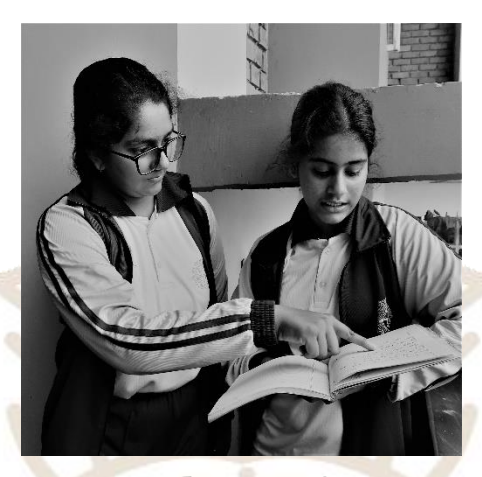
Exams and Last-minute prep