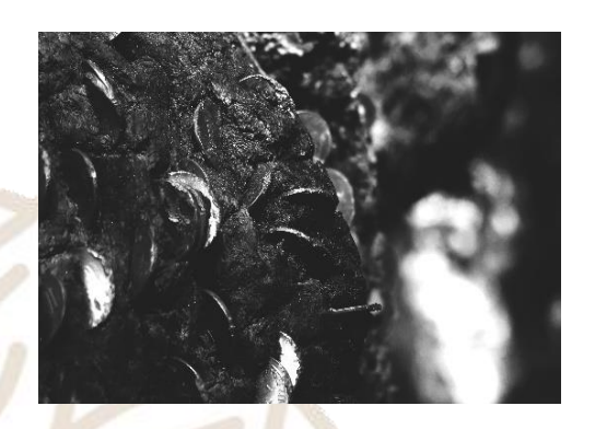
Tent of Memories