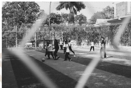
I came, I kicked, I missed.