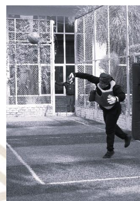
The Most Feared Player